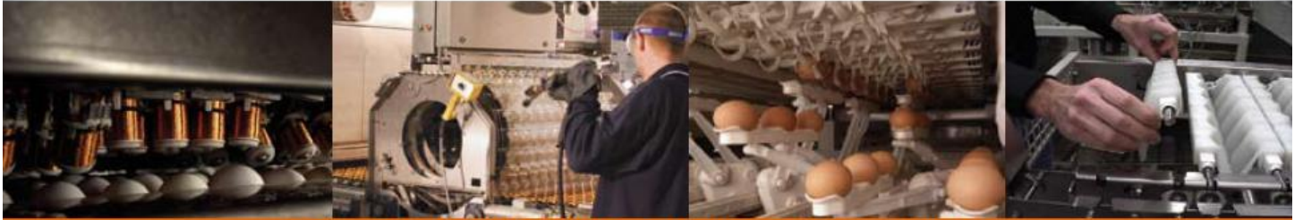
EGG GRADING AND PACKING MACHINES